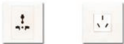
3-phase, 5-line, 380V / 220V, 50Hz

The Chinese sockets in the exhibition halls look like this: